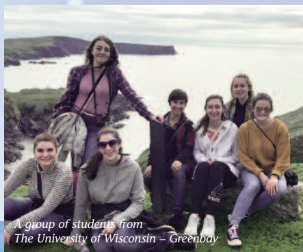
A group of students from The University of Wisconsin - Green Bay